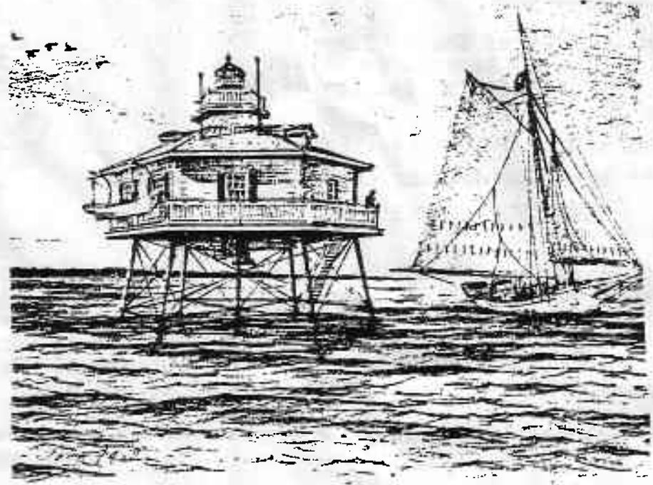
Hooper Strait Lighthouse