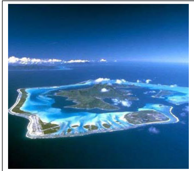
We'll have June 6 to see Bora Bora, it's Lagoon and Isles

Prices: $5957 per person Double, $7939 single Based on airfare of $1804. Land only $4153 NOTE: THIS PRICE INCLUDES $1000 PER PERSON EARLY BOOKING DISCOUNT...THIS MAY NOT LAST! ACT NOW!