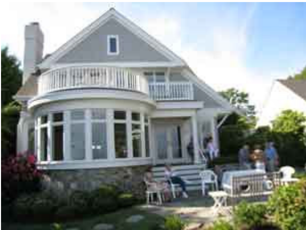
Below: House overlooking Chesapeake Bay Right: Host Reg Heitchue overlooking beverage ice bucket

On a mild summer day in late August about 30 PVSers headed out to the Heitchue weekend retreat in the Bay Ridge section of Annapolis overlooking Chesapeake Bay. One couldn't ask for more with good weather, a scenic location, with appetizers, salads, and desserts supplied by participants, and outdoor grilled shish kebobs by those host. The convivial atmosphere enabled those present to review their past experiences on and off the slopes. Participants owe loads of appreciation to the host, Reg Heitchue and Mary Beale who dealt with reservations.