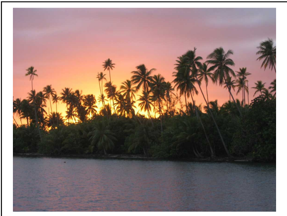
Sunrise on Raiatea, where we'll spend June 8

Prices: $5957 per person Double, $7939 single Based on airfare of $1804. Land only $4153 NOTE: THIS PRICE INCLUDES $1000 PER PERSON EARLY BOOKING DISCOUNT...THIS MAY NOT LAST! ACT NOW!