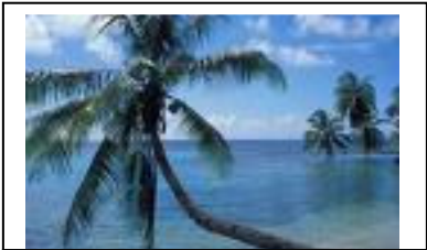
Palm Trees on Tahaa