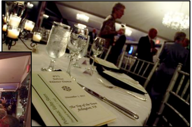
<< Ten elegant tables set for PVS members & guests overlooking Washington DC