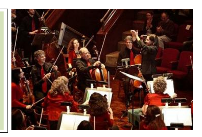
JOIN PVS FOR THE ECLIPSE CHAMBER ORCHESTRA'S CONCERT SUNDAY, MAY 7 3:00 PM

In its 25th season of world-class performances, Eclipse Chamber Orchestra, one of the nation's premier chamber ensembles, presents exceptional performances of diverse repertoire. Featured regularly on WETA-FM, ECO takes great pride in spotlighting its members as soloists in every concert where one can enjoy hearing up close the artists one sees only from afar at venues like the Kennedy Center. Please join PVS once again to enjoy the final concert of the year at the George Washington Masonic National Memorial in Alexandria. Eclipse Chamber Orchestra