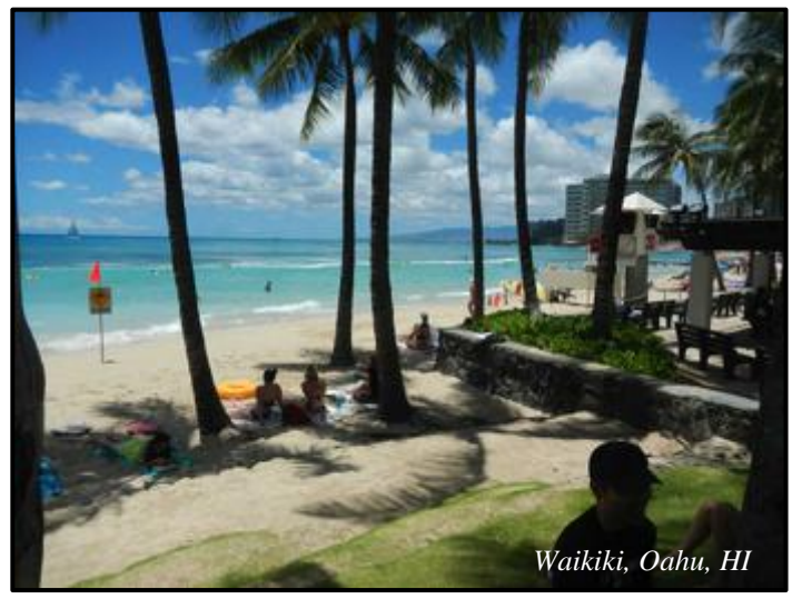
aquarium, and touring Pearl Harbor. We then boarded our

Aloha! - The Warthens recently returned from a bucketlist trip to the Hawaiian Islands. We flew 10 hours nonstop from Dulles to Honolulu, Oahu, and stayed for 3 days at Waikiki to cope with the jet lag. We enjoyed swimming in the Pacific, along with dining, visiting the