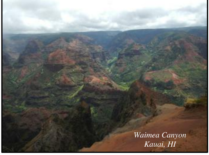
northern Na Pali Coast of Kauai, and continued back to Honolulu, Oahu for our non-stop flight home.