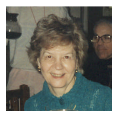
Mt. Sutton 1989