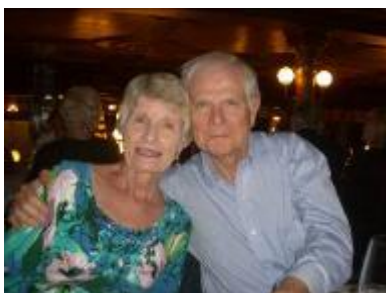
El Gran Cafe