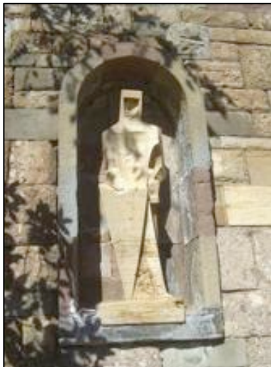
St. George at Montserrat

The food was hit or miss. Fortunately, we had some good hits. The universally good Rioja wine was a sure