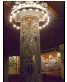
Palau Musica Catalana

One special event in Barcelona was attending a Spanish Guitar concert. The concert was in an Art Nouveau, Unesco World Heritage building, Palau Musica Catalana. The ambience was magical and the concert perfect in theme, length, setting, and virtuosity. We bought our tickets online at home pre-trip, but others in our group bought them in Barcelona with the help of the hotel. www.palaumusica.org The concert palace is within walking distance of the hotel.