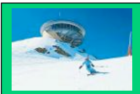
Upper Lift Restaurant

Potomac Valley Skiers is joining BRSC for a true gem of a ski trip—to one of the smallest and most mountainous countries in the world—Andorra, a skier's and tourist's paradise. And we'll visit spectacular Barcelona. There are optional trips: to Madrid and the Prado Museum, the medieval, walled city of Carcassonne, France with its winding cobbled streets, and turrets—a World Heritage Site. We'll have the opportunity to visit the fortress city, Toledo with its Christian, Jewish and Islamic heritage, and Segovia and Avila to see the 2,000 year old Roman aqueduct, the fairyland castle of Alcazar and more.