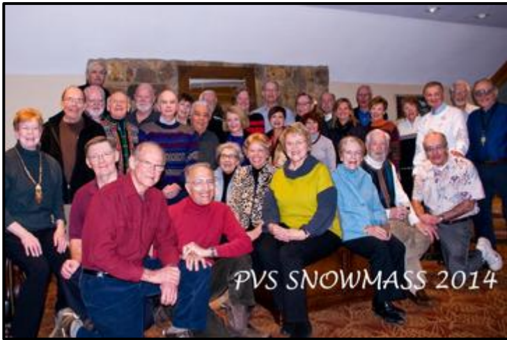
Our group at the Snowmass Club

breakfast, there was always hot and cold cereal, homemade breakfast cake, and either pancakes, French toast, or scrambled eggs. At lunch, we had a choice of two soups, such as minestrone, chicken gumbo, chicken with rice, cream of potato, ham and bean, and chili, along with excellent rolls and fruit.