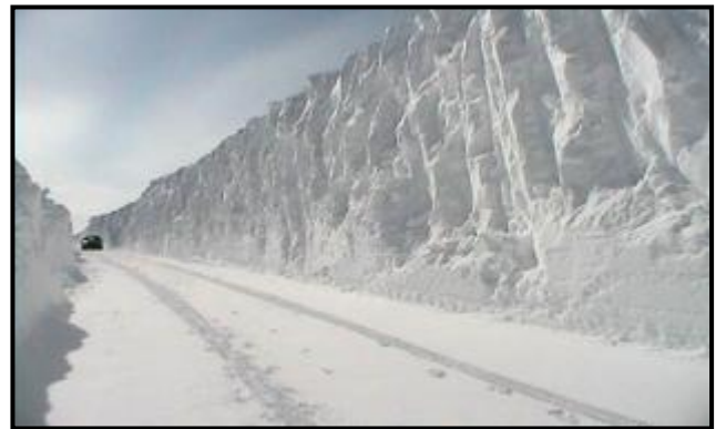
The Road into Liberty after a 1988 Snowstorm