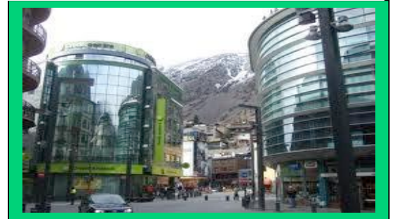
Cosmopolitan downtown Andorra la Vella