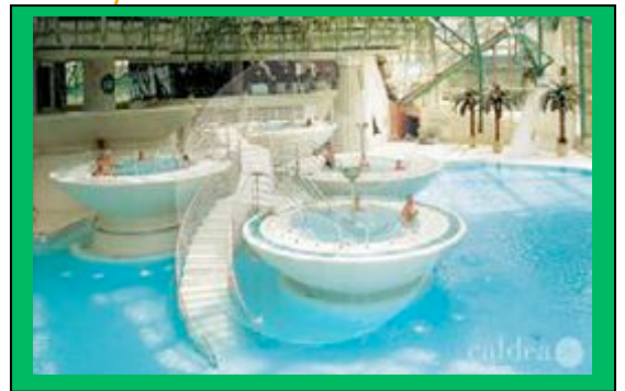
Caldea, the world-famous spa in Andorra