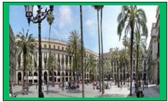
Gorgeous downtown Barcelona

Trip cancellation insurance is available for all group participants. Cancellation insurance is not included and it's not a function of age. It's only $165 each. We recommend this insurance--which you will need to pay separately with your August 10 payment. You must make out a separate check for $165 per person; the check is made out to "GTU, Inc." and it must have your name(s) on the check and "Cancellation Insurance for Andorra Trip" in the subject line. (This check will likely take quite a while to clear.) Emergency evacuation insurance is included in the trip price. This insurance covers skiers evacuating from the mountain and expenses related to an early or delayed departure home.