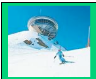
Upper Lift Restaurant

Skiing in Andorra is World Class. It's huge; 6 separate ski areas with 7,600 acres, a vertical of 3,575 feet, 111 lifts with a capacity of 156,390 skiers/hr, and 187 mi of runs. Lift tickets are not included, but don't forget - for those 65-70 a lift pass is only 18 euro/day; those over 71 ski free!