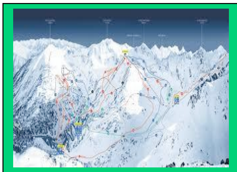
Andorra has enough skiing for everyone