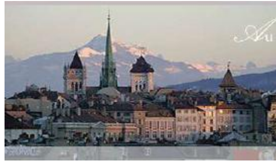
The Old Town

Geneva's ancient Old Town is a maze of sloping cobblestone streets and alleyways filled with cafes, boutiques and historical landmarks at every turn. A former Roman marketplace, the Bourg-de-Four is the oldest public square in Geneva and remains a hub of activity surrounded by bistros, terraces, bars and other popular meeting spots. The 15th century Hotel De Ville located along Rue de d'hôtel-de-Ville still serves as the seat of government in Geneva and is the site of many political milestones including the first convening of the Geneva Convention in 1864 and the founding of the League of Nations in 1920. Towering over the Old Town in the heart of the city, Saint Peter's Cathedral is Geneva's oldest and most impressive architectural treasure. The Cathedral was began in 1160 and took over 400 years to complete, suffering numerous makeovers and fires throughout the years. The north tower offers incredible panoramic views of the city, while the basement houses an Archaeological Museum chronicling the excavation of artifacts found beneath the cathedral, some dating back as far as 350 AD.