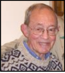
Sun Peaks (2007)