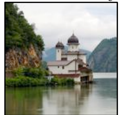
The Iron Gate