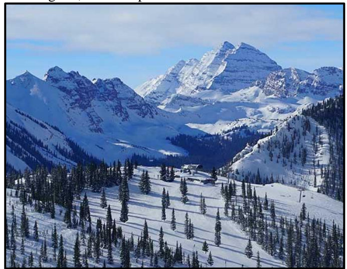
Blue skies & cheers!!!

The 2020 PVS ski season began on January 25 with the BRSC Aspen/Snowmass ski trip. It is a bit later in January this year than last year, but with a lot more skiers. Have a great, SAFE trip.