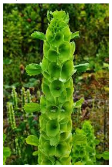
Bells of Ireland

A tradition is tied to folklore that says wearing green makes you invisible to leprechauns, which like to pinch anyone they can see. Some people also think sporting the color will bring good luck, and others wear it to honor their Irish ancestry.