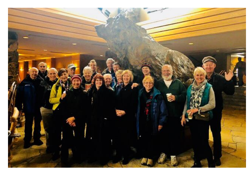
The gang's all here.