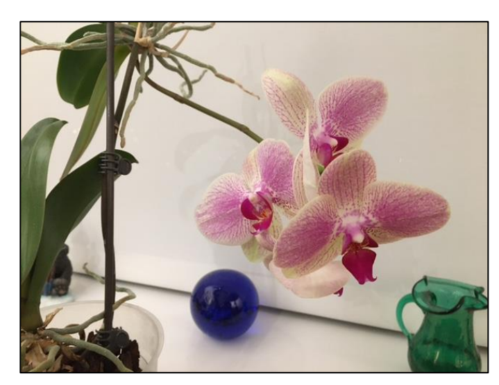
Our Moth Orchids at Riderwood

The spectacular White Dove Orchid/Egret Flower (Habernaria Radiata), above, grows in the tropics and blooms once a year during the Pentecost season.