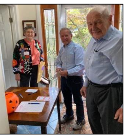
table. Marianne Soponis added a couple of items.